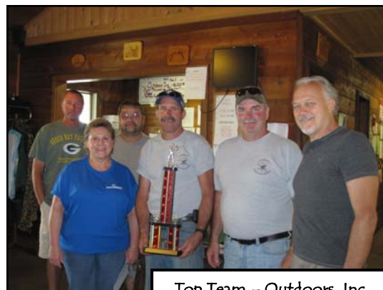
Top Team – Outdoors, Inc.

Thank you to everyone that donated or volunteered in anyway!